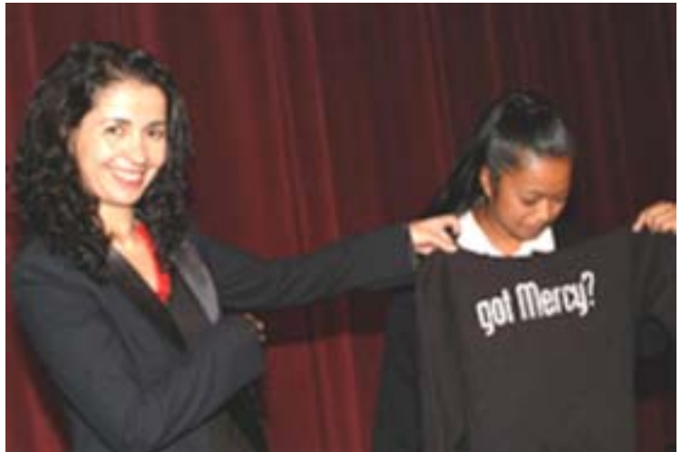
Laila Lalami's Visit

Mercy's tradition of bringing authors to campus proudly continued with Laila's visit. Over the past five years, Mercy High School has hosted a variety of guest writers including, Melba Beals, Warriors Don't Cry , Helena Viramontes, Under the Feet of Jesus , Gail Tsukiyama, Dreaming Water , and Naomi Shihab Nye, Habibi .