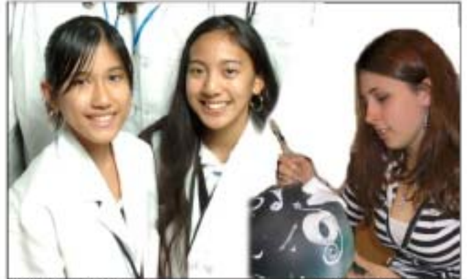
WOMEN IN MEDICINE PROGRAM

Single and gendered parking RESERVED FOR VISITORS