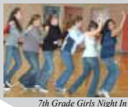
7th Grade Girls Night In

Attendance is free ~ Space is limited RSVP required by Monday, April 26: admissions@mercyhs.org Student's first and last name, current school, home address and phone